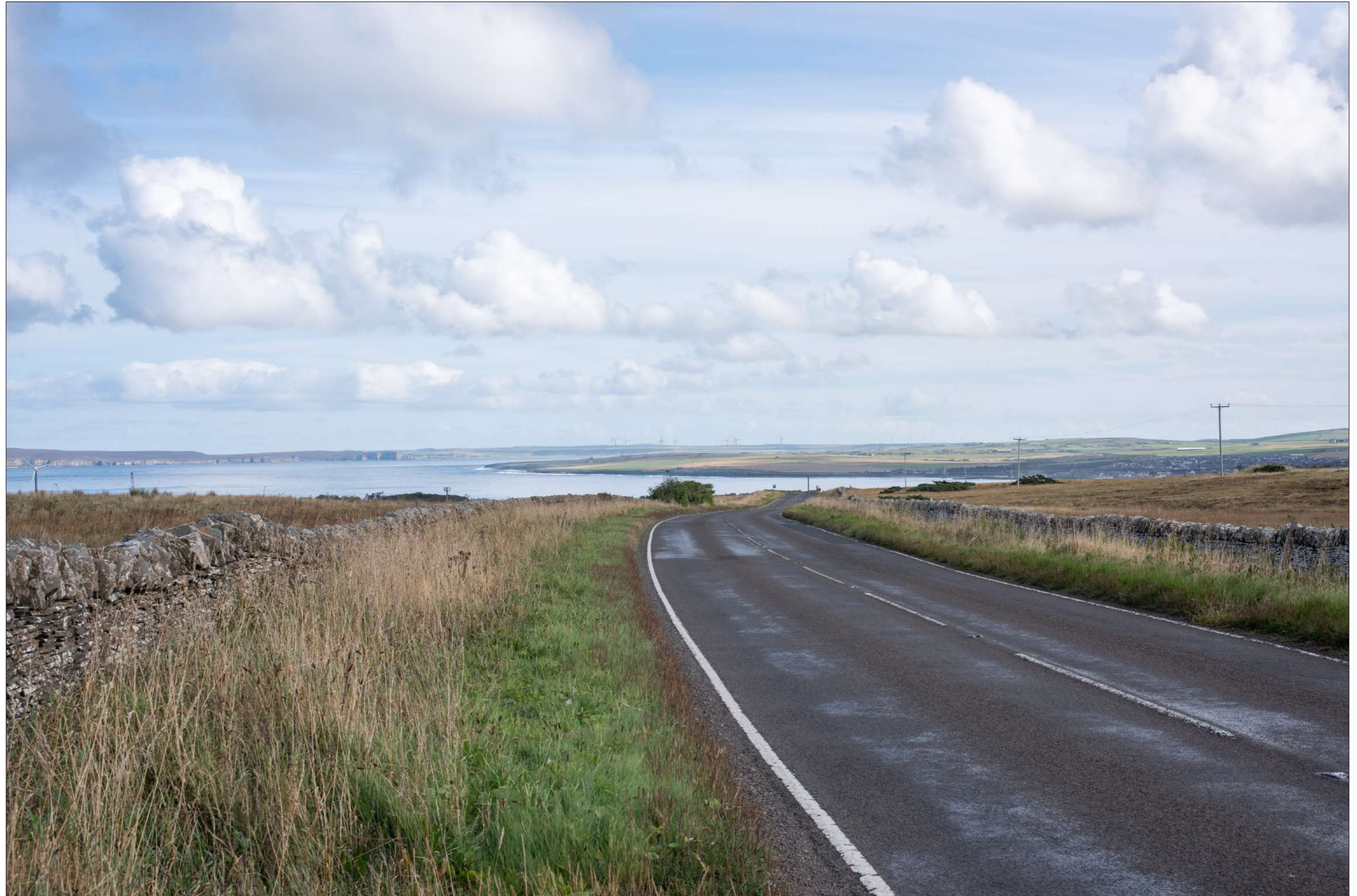
Figure: 7.20-THC-03 Viewpoint 7: A836 West of Thurso

When viewed at a comfortable arm's length (approx. 500 mm), this printed image is representative of our detailed central vision, but is not representative of scale and distance.