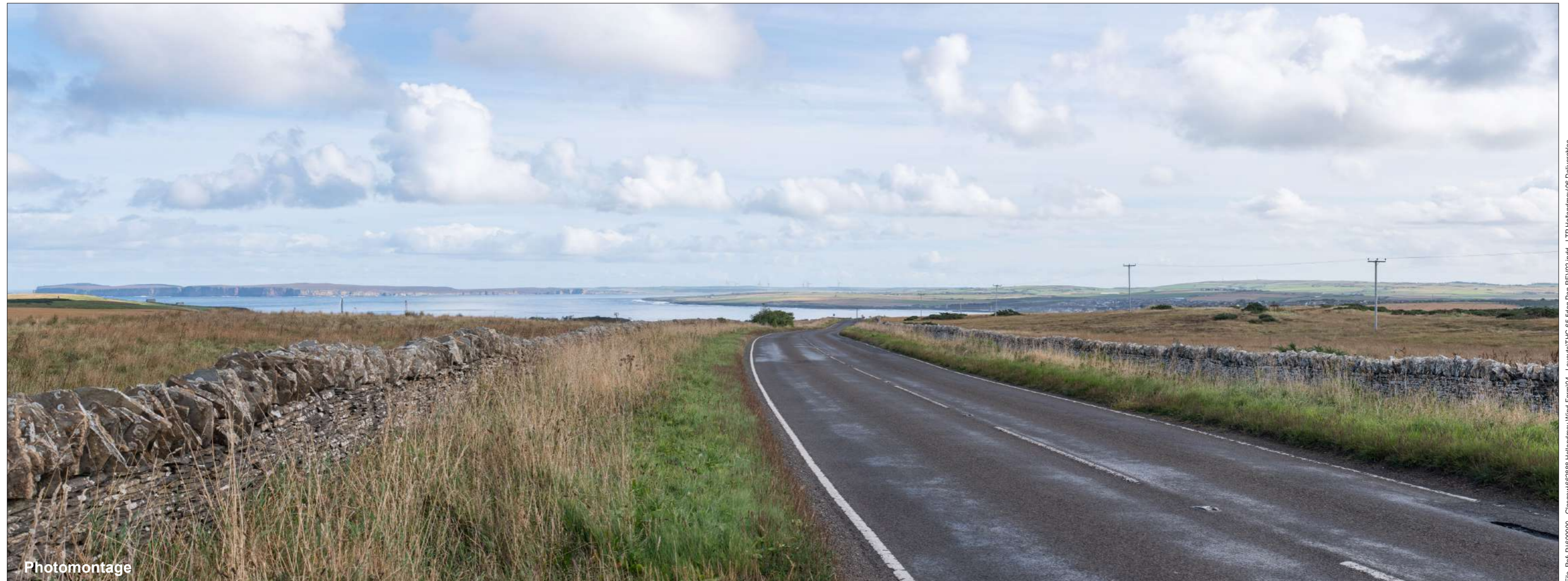
Figure: 7.20-THC-01 Viewpoint 7: A836 West of Thurso Photomontage: Planar Projection