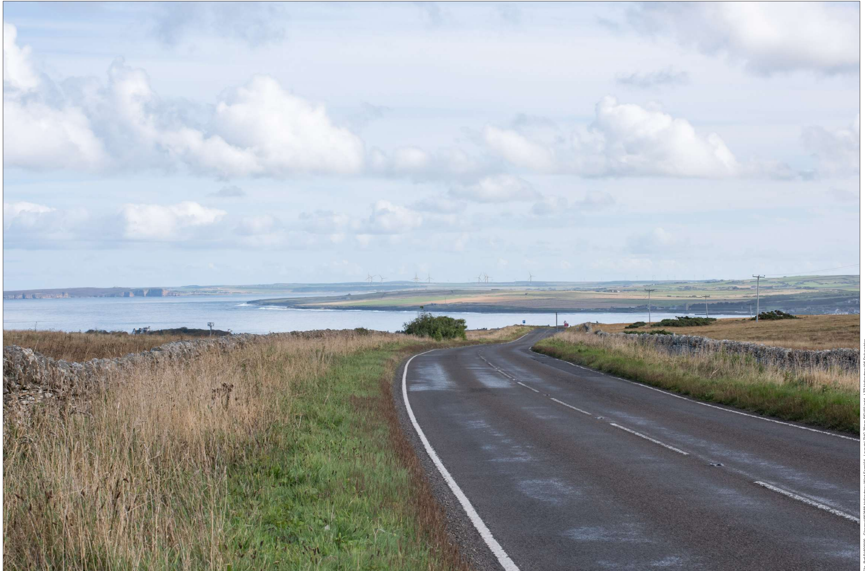
Figure: 7.20-THC-04 Viewpoint 7: A836 West of Thurso

This image should be viewed at a comfortable arm's length (Approx. 500 mm)